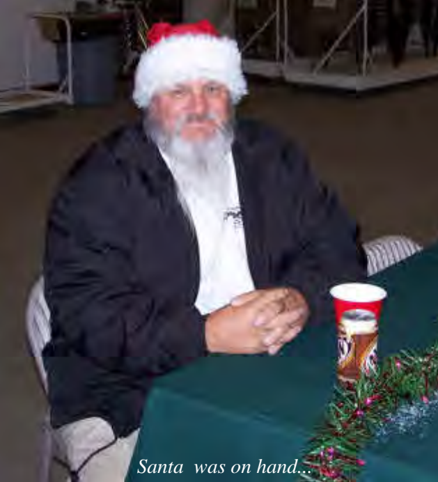
Santa was on hand...