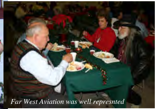
Far West Aviation was well represented