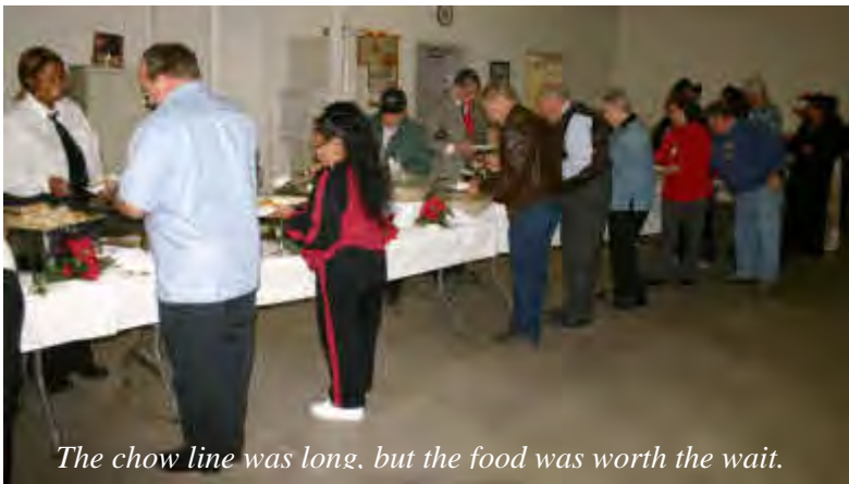
The chow line was long, but the food was worth the wait.