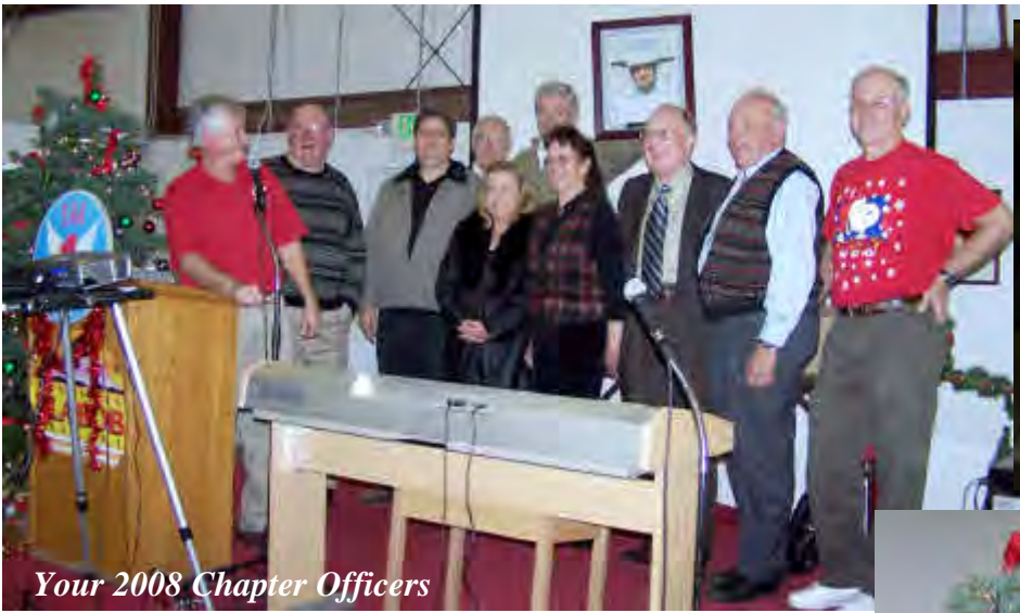
Your 2008 Chapter Officers