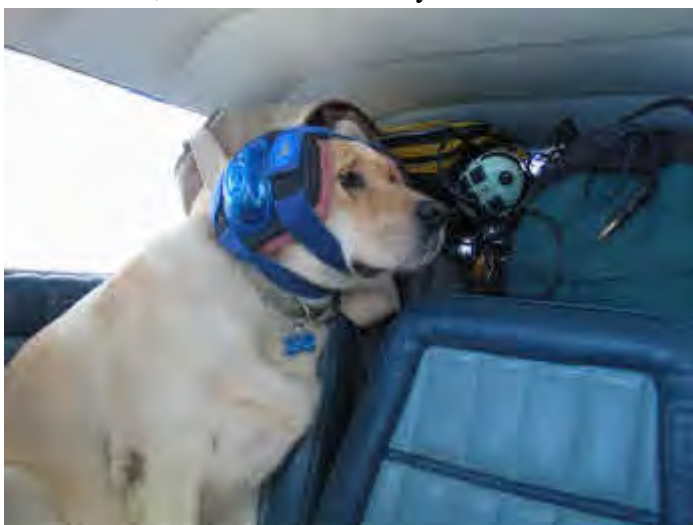
Woody in a very familiar environment--a Cessna 185

You gotta love a dog who’s large, yellow, really well-behaved, and who loves to fly.