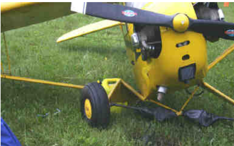
An unfortunate J-3 after Thursday’s thunder storms.

Wednesday, June 21, the opening day of Sentimental Journey, was CAVU and there was a record number of aircraft registered. On Thursday, the weather moved in, and around 7:00 p.m. there were thunder storms with high winds that damaged seven aircraft on the flight line. On Friday, KLHV was socked in and very few aircraft got off the ground. Saturday cleared somewhat, and hundreds of airplanes took the opportunity to head homeward. Still, over 130 intrepid souls remained for the Awards Banquet.