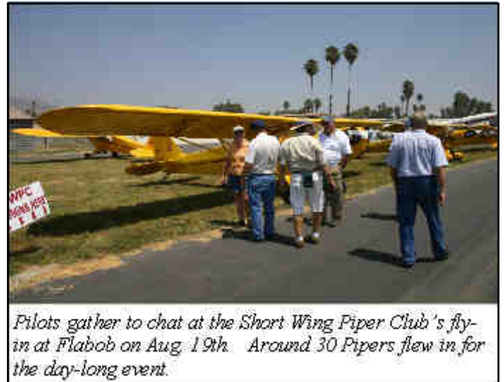
Pilots gather to chat at the Short Wing Piper Club's fly-in at Flabob on Aug. 19th. Around 30 Pipers flew in for the day-long event.